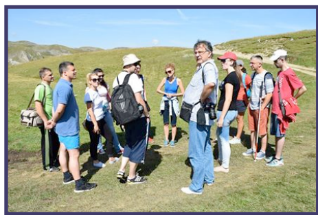
First Ethno Camp in Kolašin, Montenegro, 2 August 2015.

The first Montenegrin “Ethno Camp” was held in Kolašin from 1 to 6 August 2015, organized by the Centre for Culture Kolašin, the Cultural Society Mijat Mašković, the Centre for the Study and Revitalization of Traditional Dances and Songs, and supported by the Ministry of Culture of Montenegro.