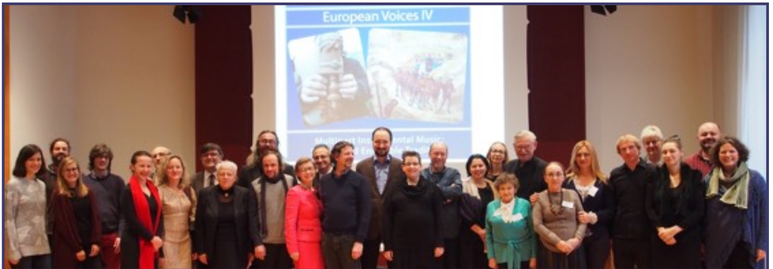
Participants of the international symposium and concerts “European Voices IV”. Vienna, November 2015.