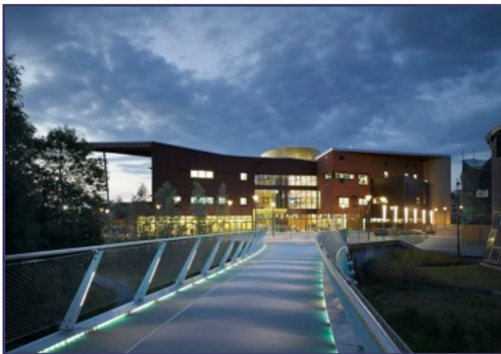
Main building of the Irish World Academy of Music and Dance, the venue of the 44th ICTM World Conference.