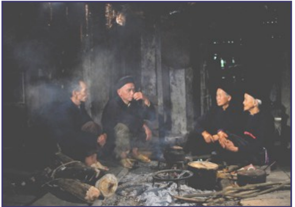
“Congratulations for new house”: a two-part singing style of Vietnam, of the the Nùng ethnic group.