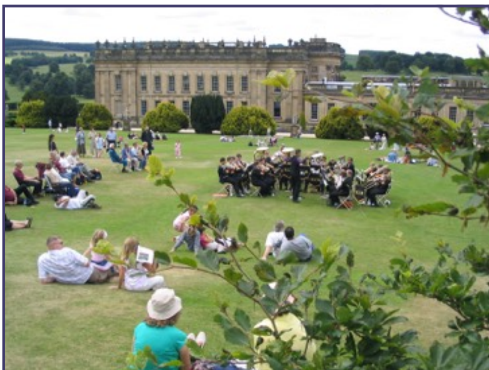
Excursion during the 2005 ICTM World Conference. Chatsworth House, Derbyshire, UK. August 2005. Visit the ICTM Online Photo Gallery.