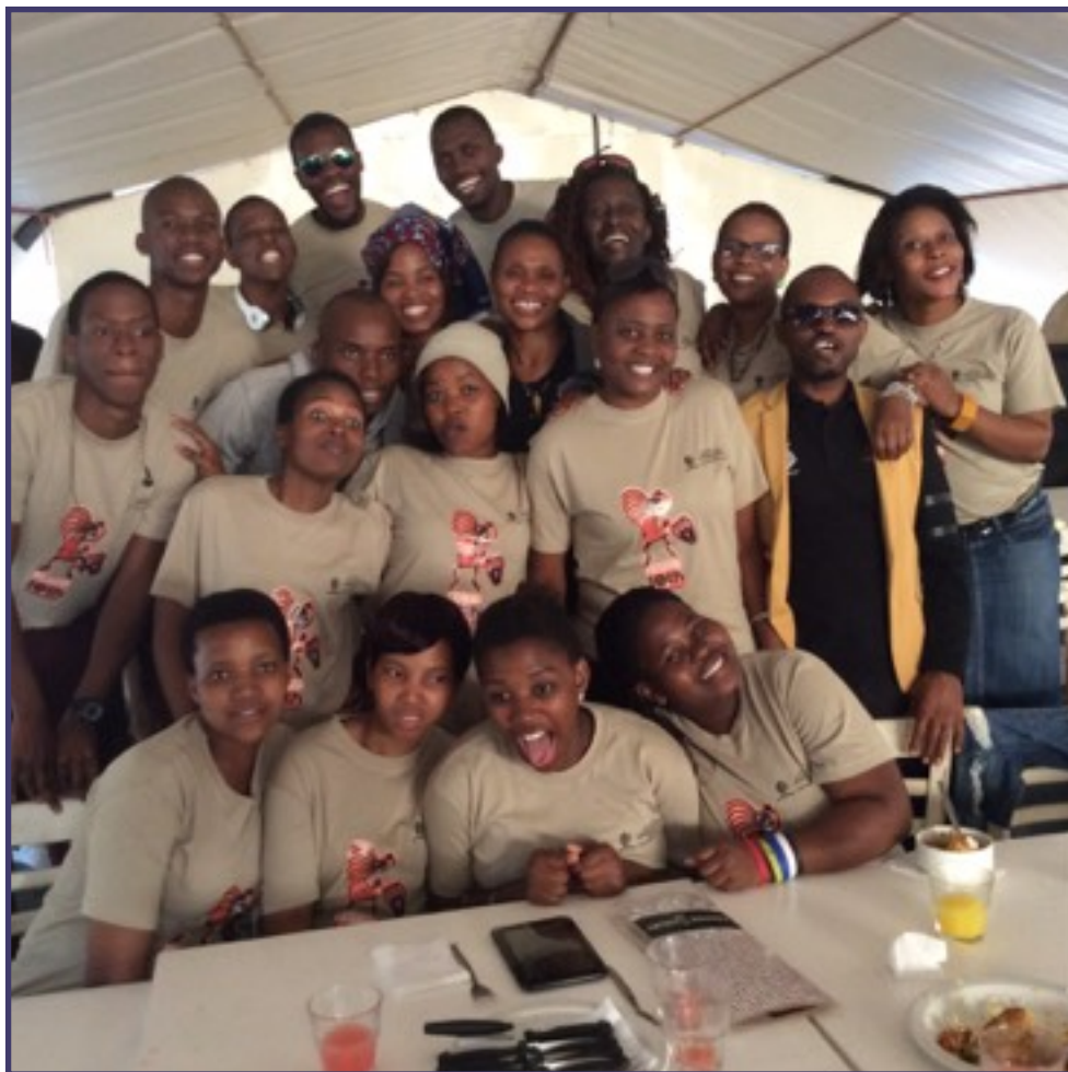
Volunteers of the inaugural symposium of the Study Group on African Musics. Durban, South Africa, September 2015.

The African Cultural Calabash is an annual folklife event curated and produced under the umbrella of the Applied Ethnomusicology section of the African Music and Dance division of the School of Arts at UKZN. This pan-African show came at the backdrop of xenophobic disturbances, and provided