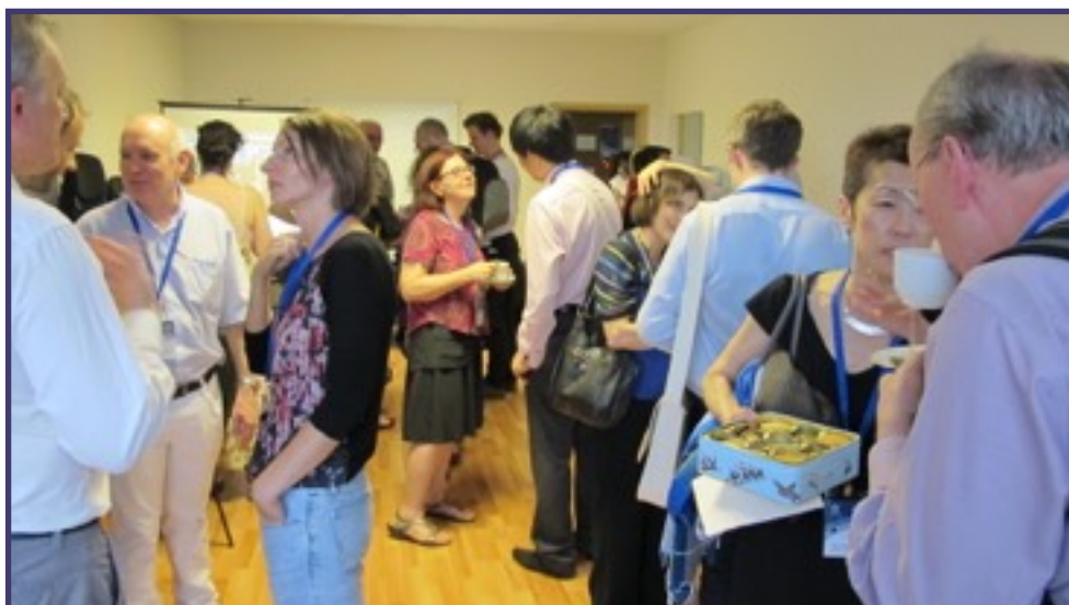
Participants of the BFE High Tea during the 43rd ICTM World Conference. July 2015, Astana, Kazakhstan.

Holding a British High Tea in Central Asia is not easy, given the challenges of transporting scones, Cornish cream and strawberry jam across several thousand miles. Tea was easily sourced from our Kazakh hosts, but in place of scones and trimmings, we had to substitute some delicious biscuits from Fortnum and Masons. This actually had an