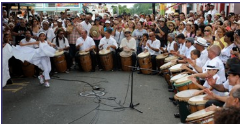
Bomba Music in Puerto Rico.