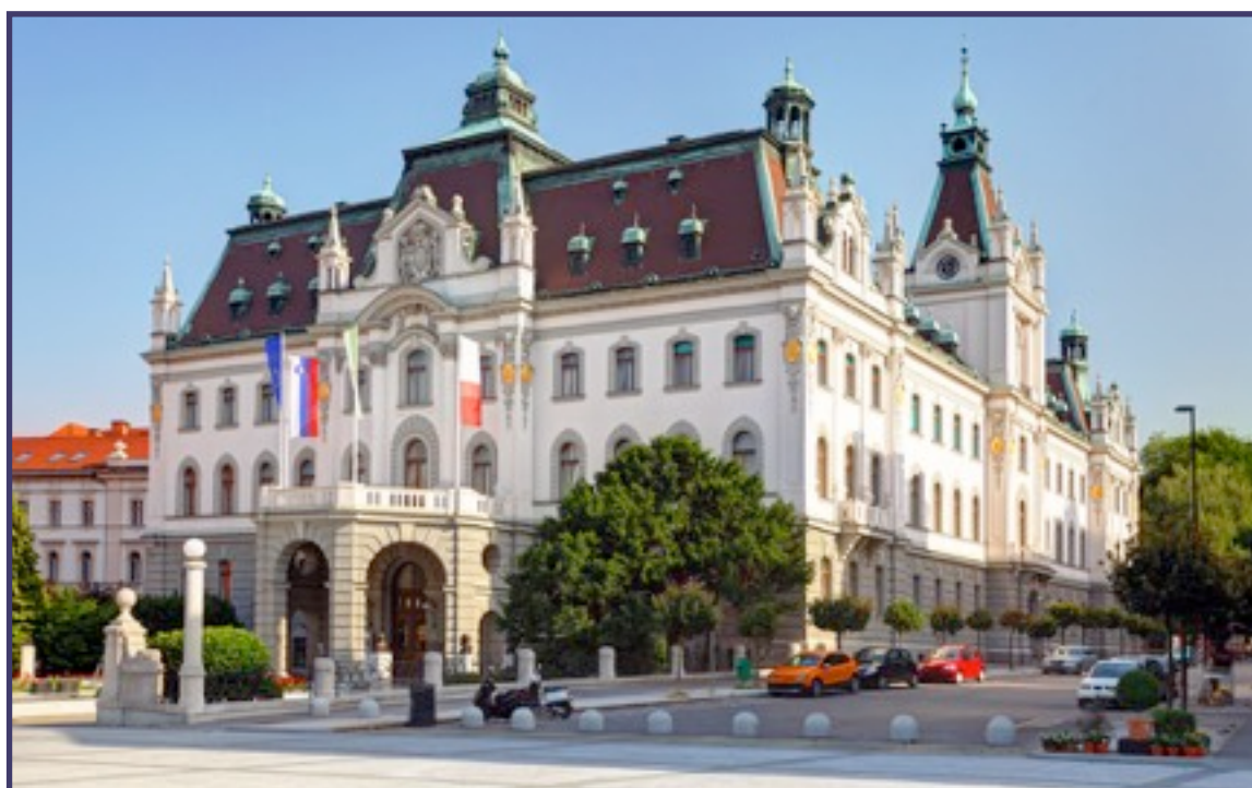
The University of Ljubljana, host institution of the current ICTM Secretariat.